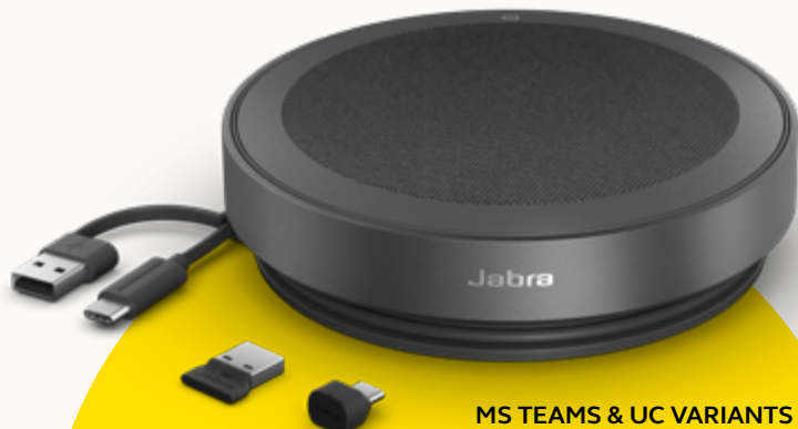
MS TEAMS & UC VARIANTS

To help consider our planet, we consider sustainability carefully at every stage of product development. The casing of Speak2 75 is made with over 33% sustainable materials 3 , and has a number of built-in parts that can be repaired or replaced. Better sustainability = longer speaker life = great calls for you and your team for years to come.