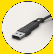
USB C and USB A connectors included